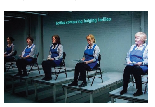
Fig. 1. Surtitles above the Stage.

vision picture. Subtitles for video and DVD are arranged according to the timecode of a single frame (1/25 of a second). Moreover, such information as speed of a subtitle appearance can be found in software. The speed frame is important in opera, as the pace of libretto can vary greatly from very fast to quite slow, i.e. it differs from the speed of normal conversation. However, the principal require-