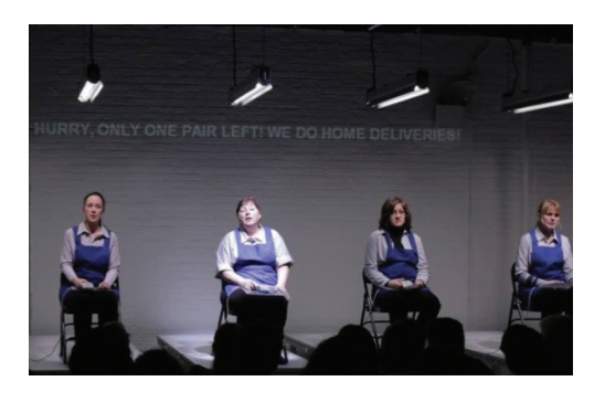
Fig. 2. A Surtitle Projected on the Wall Above the Singers.

no less essential than music, scenery, lighting, costumes and choreography. The main challenge for the spectators is to understand what is sung on the stage when solo vocal lines and chorus overlap. Various means are employed to differentiate one line from another and make the libretto translation accessible for the audience. Most of them are thoroughly discussed and